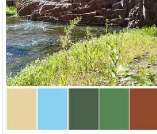
PALETTE (C): Native Reservation – soft misty glow, wolf howl, owl calls, flowing water.