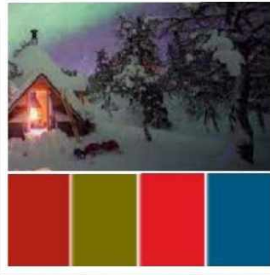
PALETTE (B): Shaman's Hut – warm earth tones, sacred, candlelight, ethnic tapestries and objects.