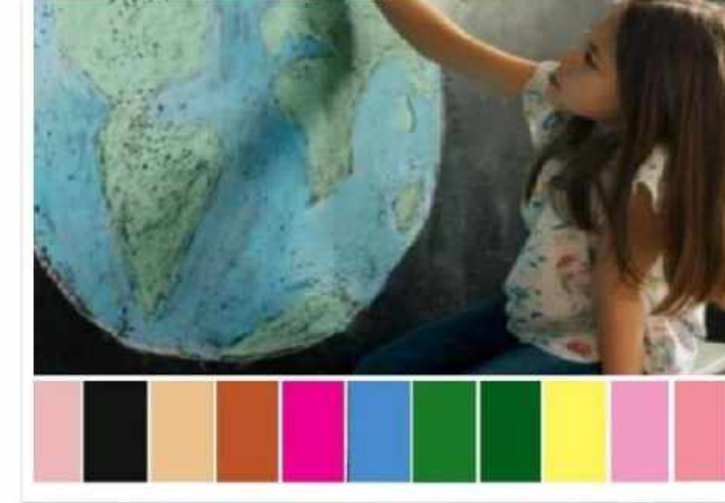
PALETTE (D): After transformation – pastel, soft, clean, warm, flowers, sunlight, feminine, peace, patience.