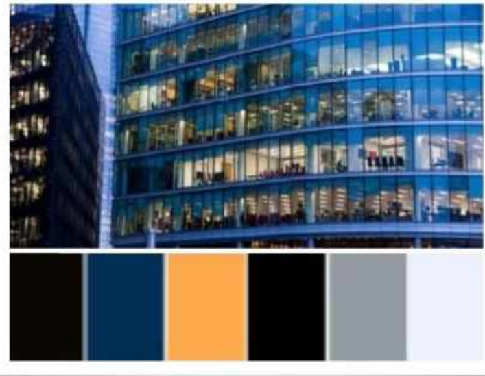
PALETTE (A): Manhattan and Connecticut – harsh, sterile, sharp focus, and contrast.